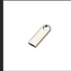
USB Drive Disk