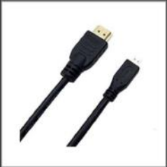
0.8M HDMI A-D Cable