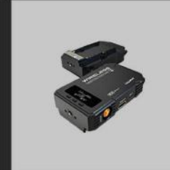
Wireless Video Transmission