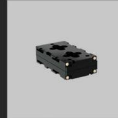
Battery Plate Adapter