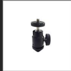
Hot Shoe Mount