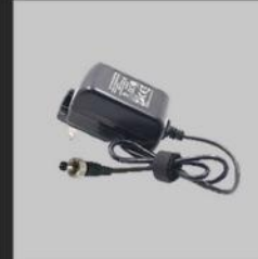
12V 2A DC Power Adapter