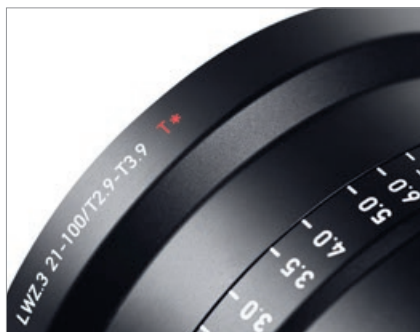
Controlled stray light and high contrast

A parfocal lens design eliminates irritating focus shift while zooming in and out. Keep the action in focus – at all times!