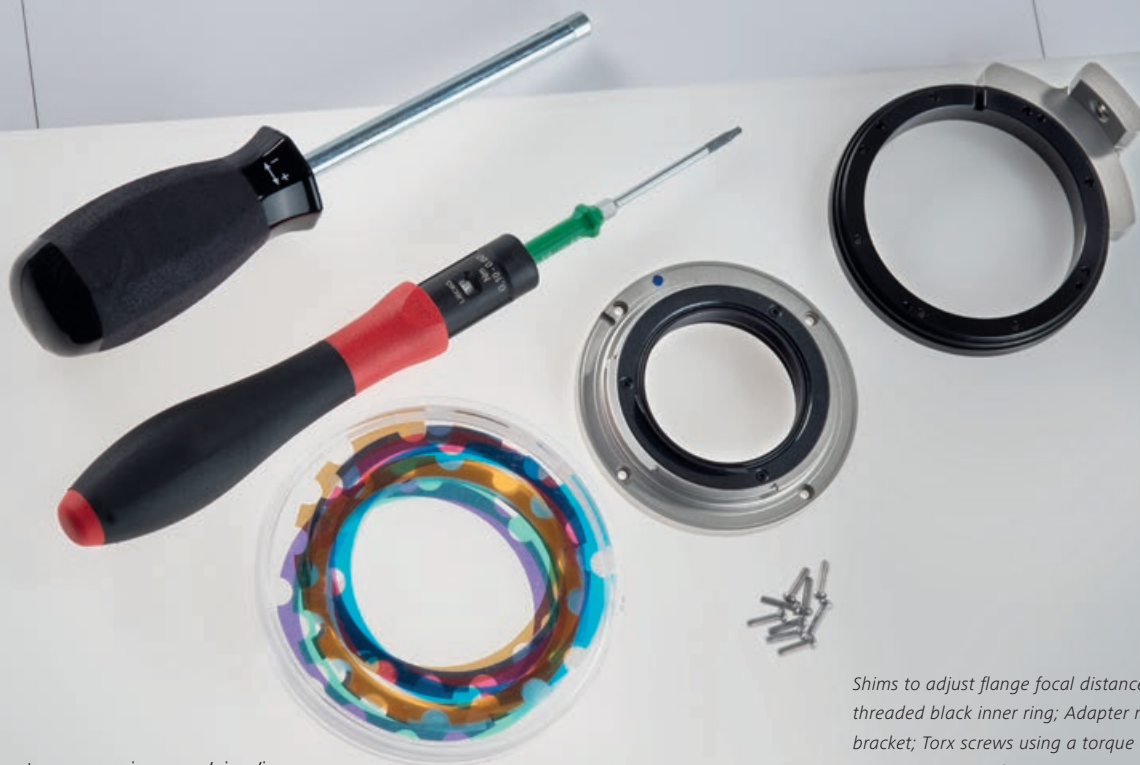
Shims to adjust flange focal distance; Mount including threaded black inner ring; Adapter ring with support bracket; Torx screws using a torque of 0.4 Nm; Screws; Siemens star test chart