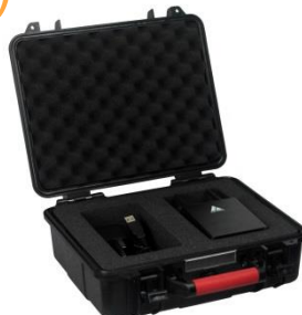
Carrying Case ART7-CSE