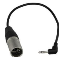
DMX Adapter ART7-ADP