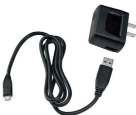
Micro USB cable Standard